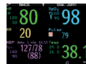
Immediately view important data, even from a distance.