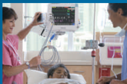
Connects to IntelliVue patient monitors for continuous capture of perioperative patient data and settings.

If your patients need 12-lead ECGs, whether to diagnose an acute coronary syndrome or as a routine diagnostic test, you can do the 12-lead capture quickly and easily on the Intellivue monitor at the bedside. With a connection to the Intellivue Information Centre iX, you can also transmit and store the ECGs in an ECG management system, or retrieve ECGs at the bedside 2 .