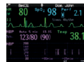
Access trending up to 48 hours in 5-minute resolution or 24 hours in 1-minute resolution. Graphical trends are also available on screen.