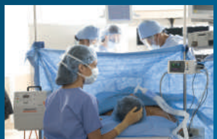
Keeps vital information in front of the anesthesiologist in the OR.