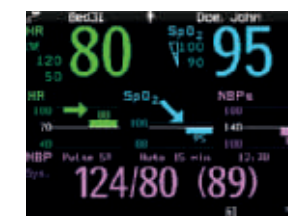
Advanced Horizon Trends feature focuses on deviations from baseline to give a detailed clinical picture at a glance.