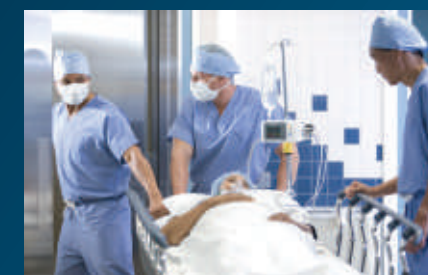
Flexible enough to be used as an induction monitor, as well as a transport monitor.